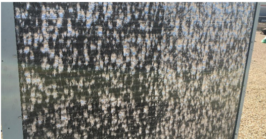
Coil Condenser Damaged by Hail

While your refrigerator can operate efficiently for years, it is likely that your gasket can weaken or tear after only a few years of use. As this important sealer starts breaking down, your unit will start working even harder in order to keep your food chilled, which means higher energy bills and shorter lifespan of the unit.