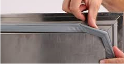
Damaged door seals can let cool air escape and make your fridge work twice as hard.

No matter what type of Refrigeration system you are running in your business, the basics of keeping them running at full performance with minimal down time remains the same. These helpful tips will keep your costs down and your business running smoothly.